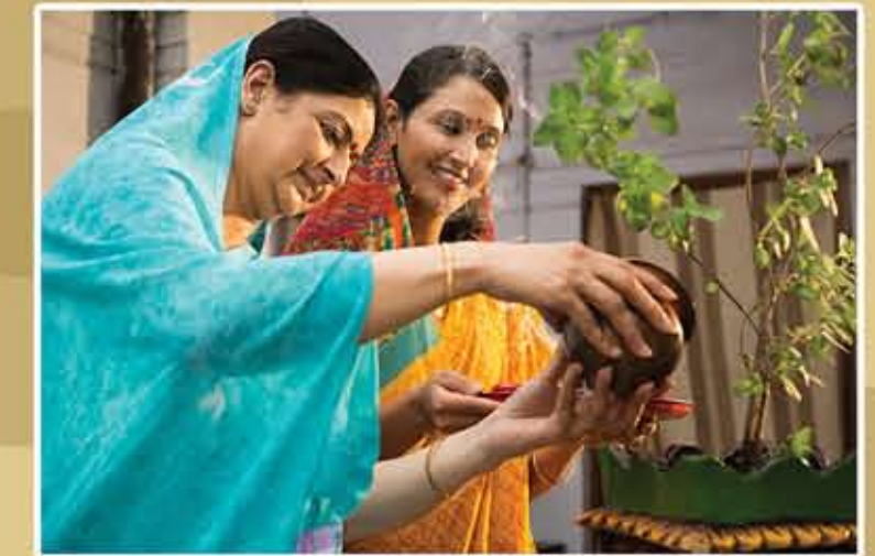
The next dimension of vill life

Which is why choosing the right home is important. It has been specially conceived for people who want more from life and their homes for that rare breed of dreamers and achievers for whom good is not good enough.